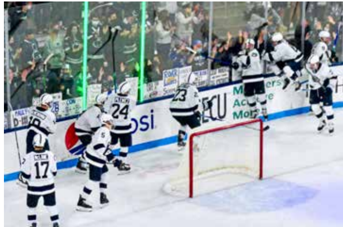
Think the Lions aren't glad the fans are back?

This past year and a half has been absolutely grueling. I think that for many, it has provided an opportunity to evaluate their perspective on things. I know that it has made me much more appreciative of the relationships and opportunities that I have. I am even more grateful to be able to get away even for a little bit of time and be a part of a fantastic production crew and to help make the game better in some small way for the Penn State faithful. Win or lose, it is always a "Great Day for Hockey" in the Valley. And seeing you all again, it makes it even better...We Are!