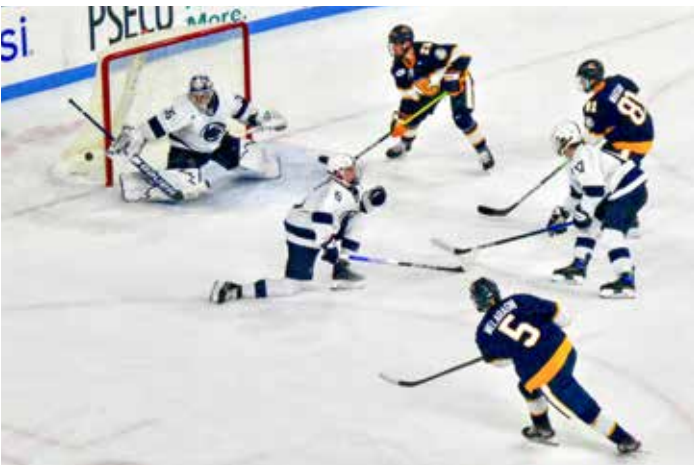
Lion goalkeeper Oskar Autio keeps it close in the series opener with Canisius.