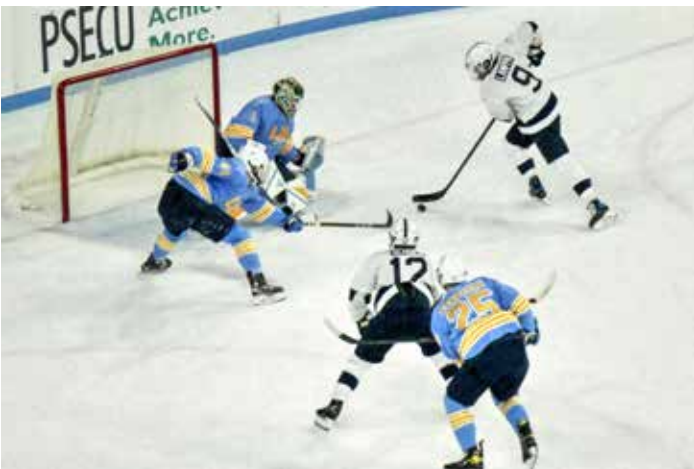
Here's how Xander lights the Lamppa in game 2 after taking a perfect feed from Christian Sarlo (not shown).