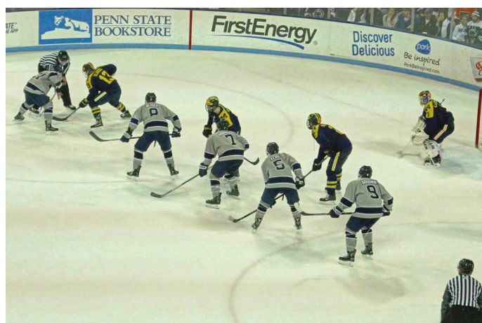
Five-on-three vs. Michigan – not good odds for the Wolverines.