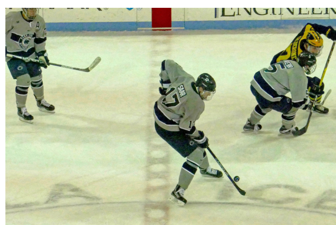
Zach Saar gains control of a bouncing puck.