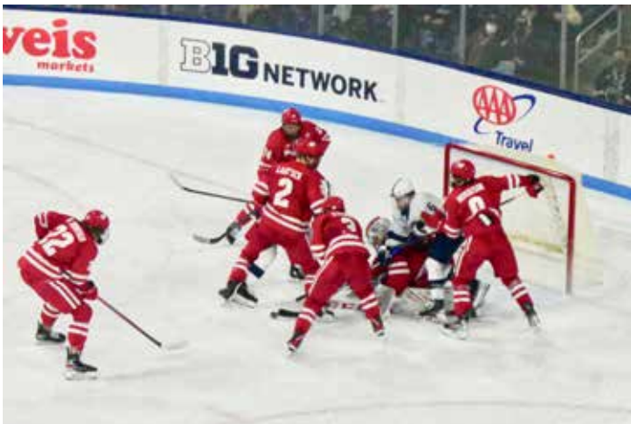
Five Badgers and the goaltender vs. two Lions. Advantage State.