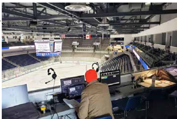
The control booth at Pegula allows for maximum viewing of the action.

RM: The control booth at Pegula is packed with equipment. For those who haven’t seen it, it is one of the two open air booths in the club level directly above the Gate A overlook (the other being the booth for office officials and instant replay analysis). Despite 10 years, the layout is close to the same as it was for that first game against Army.