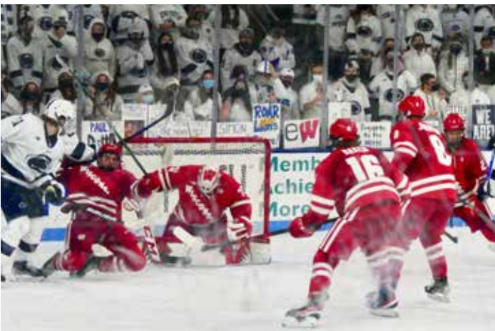
On Saturday, the Lions unleashed 51 shots on the Badger goal.